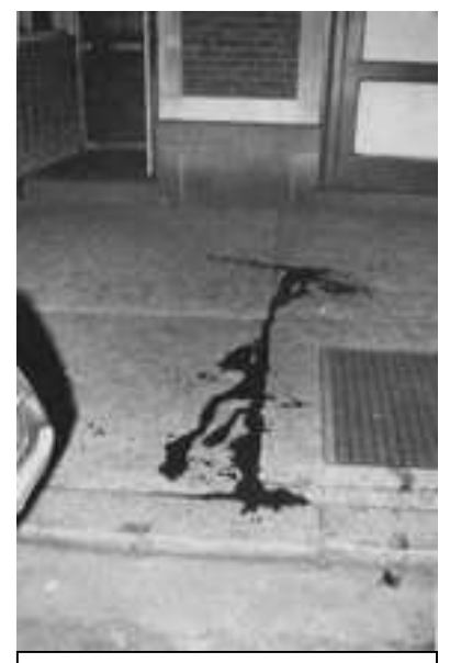
A cop is shot, and early on...

since the trial, we have a training tape where they trained the prosecutors, that when you have an African American defendant, and the alleged victim was white, remove every person of color you can. You know, particularly African Americans. That's what they did in this case, and constitutionally, that's just intolerable.