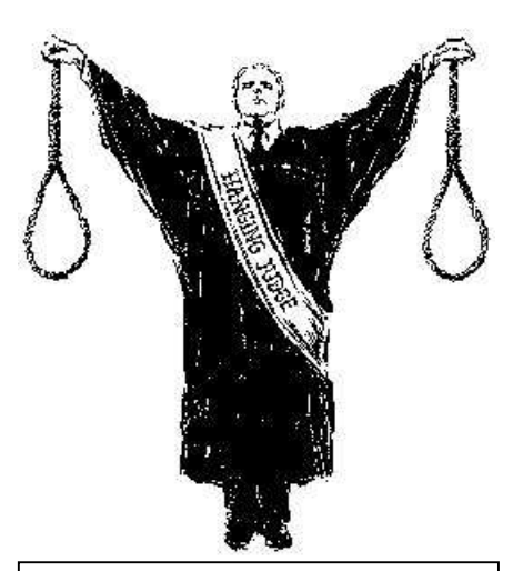
...a career built on 32 dead bodies, most of them colored.

Of course none of this evidence has been permitted to my understanding.